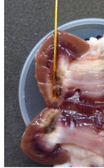
Figure 2. Kidney sample after the MTA. The applicator was positioned so that the ablation zone partially covers all three tissue types: cortex, outer medulla and inner medulla.

All of the measurements were performed acquiring 101 linearly spaced frequency points within 500 MHz – 8.5 GHz frequency range. Three consecutive dielectric properties measurements were performed on each tissue ( N = 3 ) for each sample ( N = 3 ) before and after the ablation procedure; in total 54 measurements were performed. The measurements were performed following the measurement protocol for characterization of dielectric properties of tissues [20]. All experimental data and associated metadata was collected in line with the Minimum Information for Dielectric Measurements of Biological Tissues (MINDER) guidelines for reporting of dielectric data of biological tissues [21].