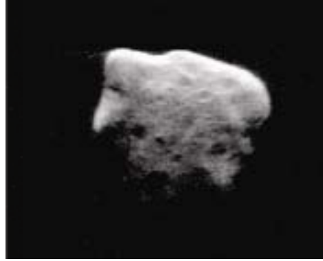
Fig. 1: Arecibo 15 m resolution delay-Doppler image of the 3.5 km NEA 1999 JM8

A sequence of observations over several observing sessions can be used to obtain a very detailed shape model plus the pole direction via least squares fitting techniques (Fig. 2). The complementary astrometric data used for precise orbit determinations has accuracies of a few meters in range and millimeters per second in radial velocity. The Arecibo Observatory, with its great sensitivity and a well-established commitment to observing targets of opportunity whenever possible through the utilization of flexible scheduling techniques, has, over the last 8 years, typically observed 20 – 25 NEAs per year with about half of those being “targets of opportunity” scheduled within days or hours of discovery.