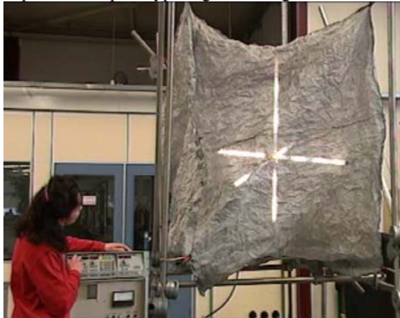
Figure 2: The VIRC: a flexible tent with irregularly shaped walls. The field is stirred by moving the walls

A picture of a prototype is given in Figure 3.