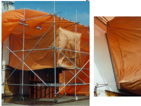
Figure 4: The VIRC as built for in-situ testing

Figure 5 the vectorial sum of the magnitude of the field strength in the three orthogonal directions, with respect to the mean field strength, per measuring position has been drawn as function of the frequency. From this figure we can conclude that the field strength is within the 0-6dB range for frequencies higher than 150 MHz.