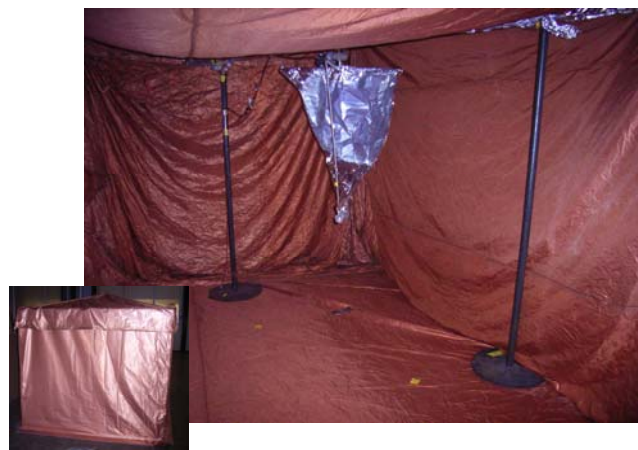
Figure 3: A Tuneable Intrinsic Reverberation Chamber, lower left outside, right inside