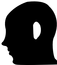
Fig. 2. A proposed 6 mm thick smooth lossy ear phantom to obtain peak 1- and 10-g SARs within \pm 10\text{-}15\% of those obtained for anatomically-realistic models. This model with the lossy ear replaced by a 6 mm thick plastic ear ( \epsilon_r = 2.56 ) gives SARs that are a factor of 2 or more lower as given in Tables 2, 3.

A 6 mm plastic spacer homogeneous model with brain-simulant properties is presently used by industry and has also been proposed to obtain a "conservative" determination of the peak 1-g SAR of body tissues for SAR compliance testing of cellular telephones [5]. An identical 6 mm "plastic ear" homogenous model has also been proposed to determine peak 10-g all-tissue SAR for compliance testing against the ICNIRP Guidelines [4]. For our calculations, smooth ear models corresponding to the two anatomic models of Fig. 1a, b is used. For example, the model thus developed for the Utah model of the human head shown in Fig. 1a is given in Fig. 2. A dielectric constant \epsilon_r = 2.56 is assumed for the plastic in the shape of the smoothed ear and the 2 mm thick container, while homogeneous dielectric properties representative of the head tissues ( \epsilon_r = 41.5 , \sigma = 0.9 S/m at 835 MHz and \epsilon_r = 40.0 , \sigma = 1.4 S/m at 1900 MHz) are assumed for the rest of the model [5].