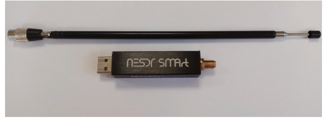
Figure 3. USB Software Defined Radio Receiver and telescopic monopole antenna for FM signals reception.

The low cost RTL SDR “Nooelec NESDR SMART” (Fig. 3) was used for the receiver of our system,. It is an improved version of classic RTL SDR dongle based on the same RTL2832U Demodulator/USB interface IC and R820T2 tuner. It comes with ultra-low phase noise 0.5 (Phase noise @ 100 kHz: -152 dBc/Hz) PPM temperature compensated crystal oscillator (TCXO) with cooling via thermal pads and with an SMA connector. The tuning frequency range is from 24 MHz to 1850 MHz with sampling rate up to 2.8 MS/s and noise figure about 3.5 dB. Gain control is also provided, through the embedded low noise amplifier (LNA) at the input of R820T2 and at the output via a variable gain