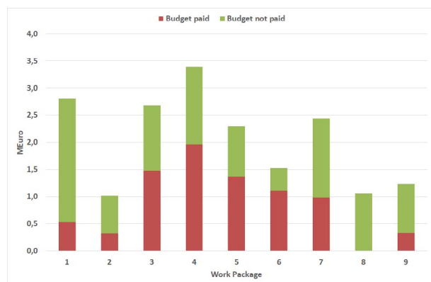
Figure 3. Histogram of the budget allocated to the PON-SRT for the nine WPs. The red and green colors indicate the amount of money spent and not yet spent, respectively, at the date of writing this article (December 2021).

The allocated funds are not available for research and development activity and hiring new personnel but restricted to the purchase of components, instruments, and equipment from companies or research institutes. Several administrative procedures (open tenders above and below the European Union threshold and competitive dialogs) have been issued for the selection of the suppliers. As shown in Figure 3, the budget is not equally distributed across the nine WPs. More than half of the total budget is used for the new receivers, 20% for the backend and HPC, 20% for metrology and infrastructure, and the remaining for the laboratories. In particular, the budget ranges from 1.000.000 € for the