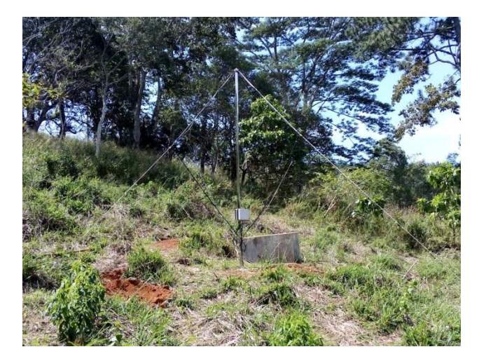
Figure 1: ELF/VLF receiver in Sri Lanka. It is in the Hantana mountain range and managed by University of Peradeniya.

The VLF signal is sampled by 16bit at 200 kHz and stored in 10 millisecond long frames. Each frame header contains a timestamp with 80nanosecond accuracy.