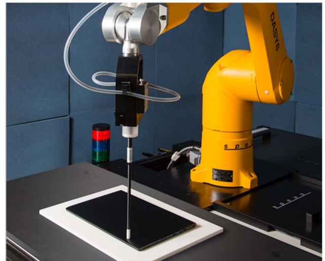
Figure 1. Power density measurement system using a pseudo-vector probe.

plane is large enough to cover the relevant field emitted by the source, the total field can be computed on arbitrary observation points in the half-space away from the measurement plane. This is achieved by evaluating the surface current integrals with the free-space Green's function at the observation points of interest. We are