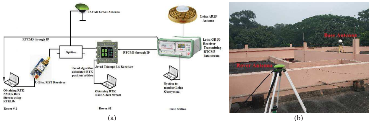
Fig.1: (a) Schematic diagram of base-rover connection; (b) Leica AR 25 and Javad GrAnt antenna under the open sky on the rooftop of GNSS Laboratory, The University of Burdwan, Burdwan, India.

Collected data are analyzed for solution capability of the rovers in RTK mode and the scatter plot of position is shown in fig. 2. It is witnessed that in case of rover #2 (uBlox) some points are scattered more in East-West direction in comparison to rover #1 in RTK operation; while in case of rover #1 (Javad), the RTK solutions are more precise, as expected. The precision level parameters are calculated and shown in Table 1. Maximum variation in longitude and altitude is more in rover #2 than that of rover #1; however, for the rover #2, the low-cost receiver module, the longitudinal variations remain well within a meter. It is observed that rover #1 provides either Fix or Single solution because the default setting of this receiver is to provide only Fix solution, but uBlox provides either Fix or Float solution. Rover #1 can fix ambiguity to integer maximum times rather than that of rover #2. It is also observed that, 2DRMS is in the order of centimeter for rover #1 and few centimeters for rover #2. And the 3D precision level is within cm level for both the receivers and the survey grade receiver provides one order better solution accuracy.