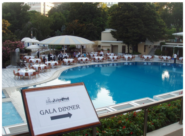
The marvellous pool-side setting for the “URSI Gala Dinner” held at the Hilton Istanbul Hotel