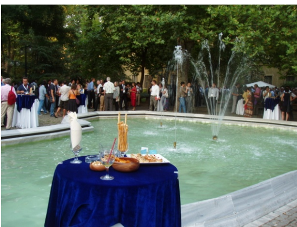
Informal gathering and networking at the “Welcome Reception” held at the Harbiye Cultural Center & Military Museum, Istanbul